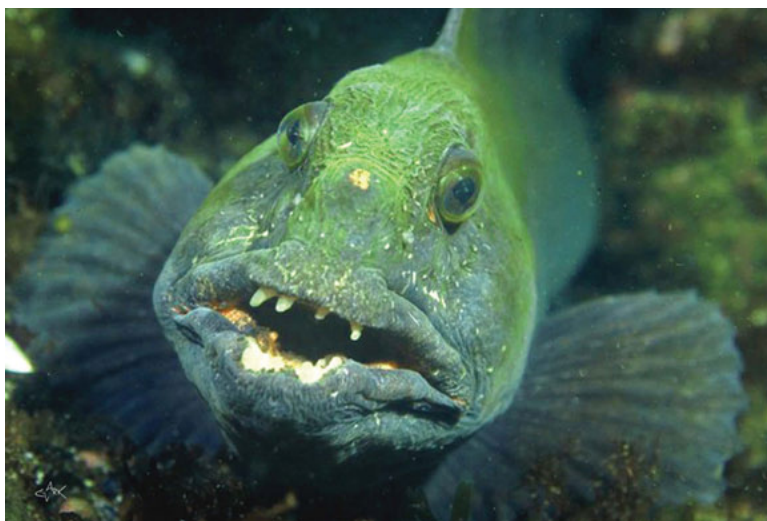
Wolfish at Fast Castle

I had a snorkel into the cave and a look around inside, but the slippery rocks were too dangerous for a diver on his own.