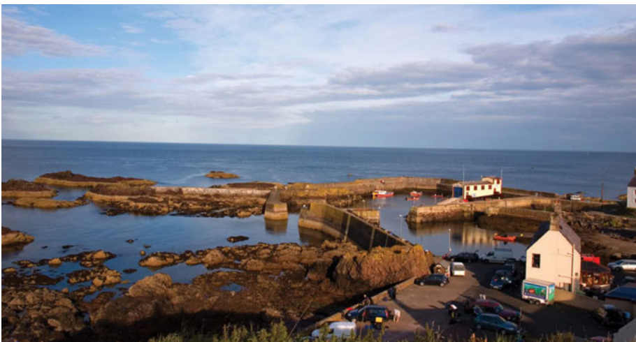
St Abbs harbour

Parking charges apply at the harbour. Rates are per hour but whole day parking currently costs £7