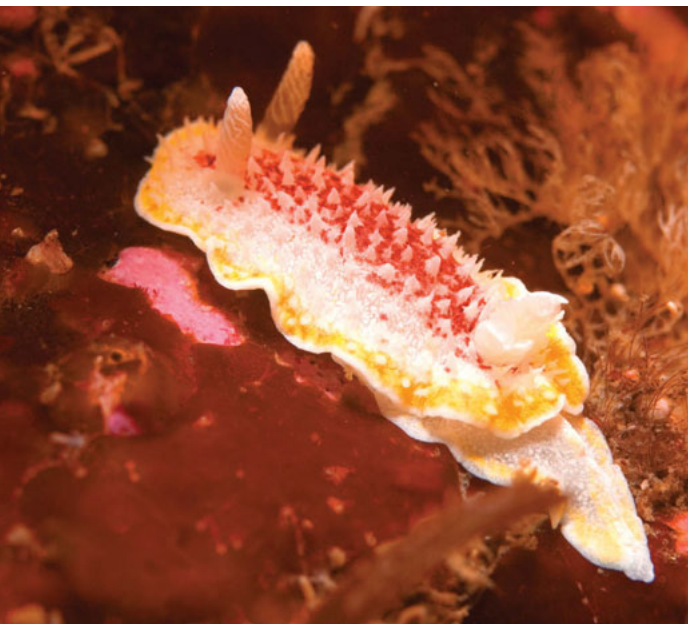
The Souter nudibranch